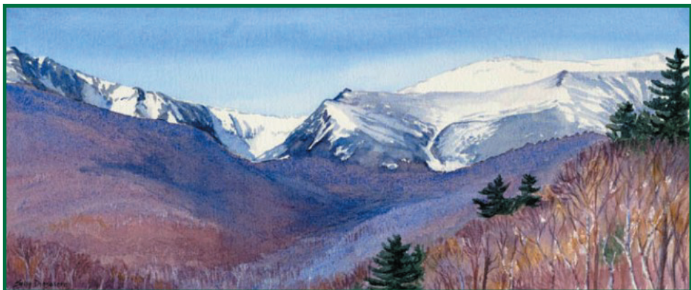
Painting by Sally Dinsmore-Baldwin